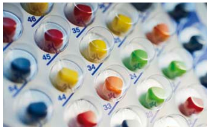
Patient medication without risk of confusion: Collano adhesive systems for blister packs.

Collano – Your partner for smart bonding.