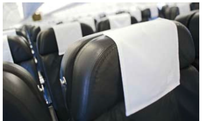
Flame-retardant, multifunctional: Collano adhesive tapes for more comfort and safety in aircraft.