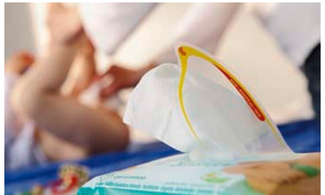
Collano makes packaging resealable: for products such as wet wipes for cosmetics, cleaning and baby care.

It's an old prejudice that environmental friendliness compromises performance. Collano produces ecological hot melt adhesives from sustainable raw materials. They have the same properties as conventional hot melts: the same performance with an excellent ecobalance!