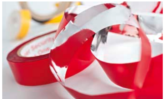
Collano adhesives indicate tampering attempts using heat, cold or chemicals and provide optimized protection against theft.